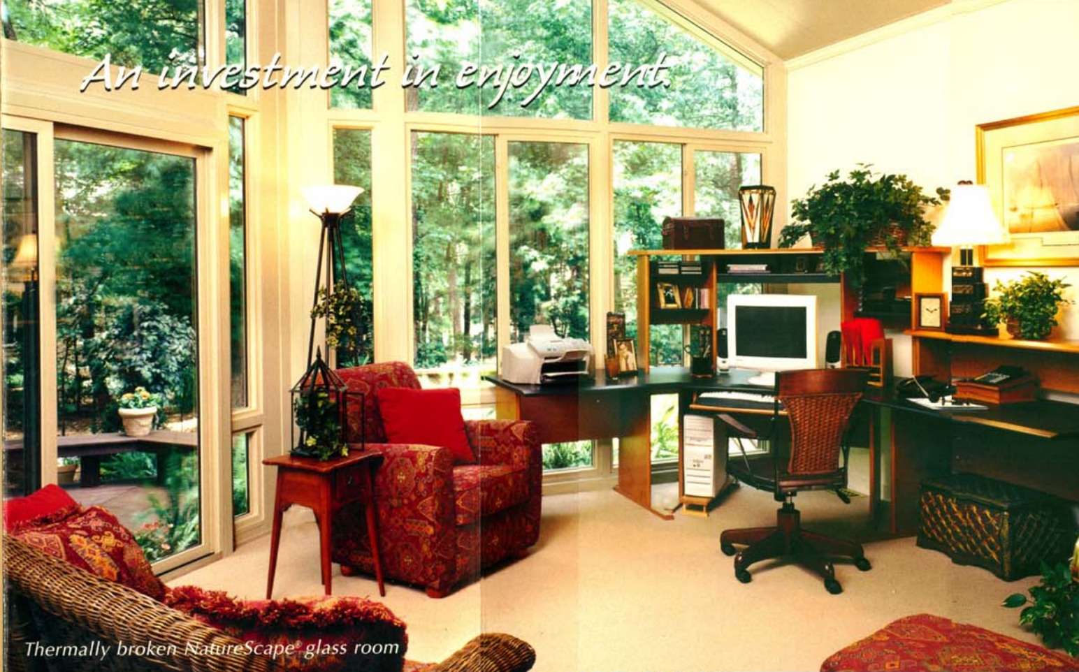
Thermally broken NatureScape® glass room