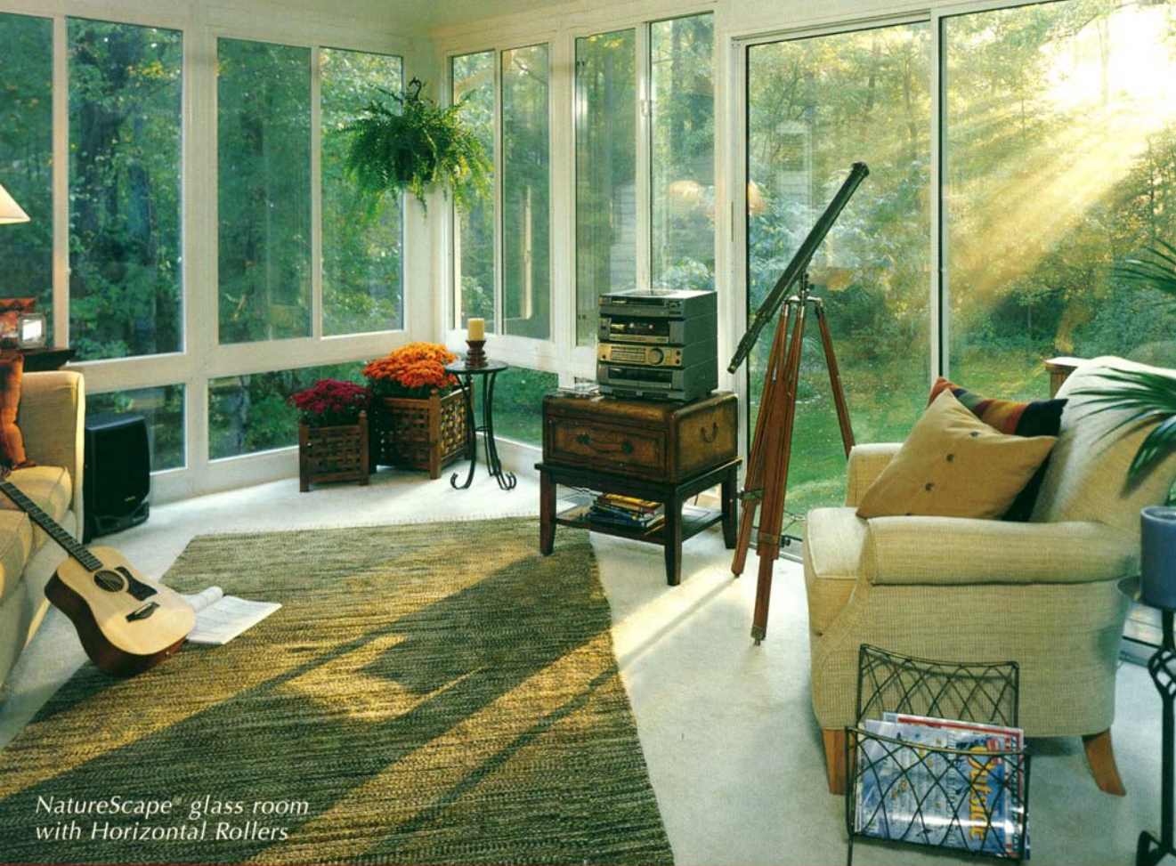
NatureScape® glass room with Horizontal Rollers

Open up your view and savor the seasons.