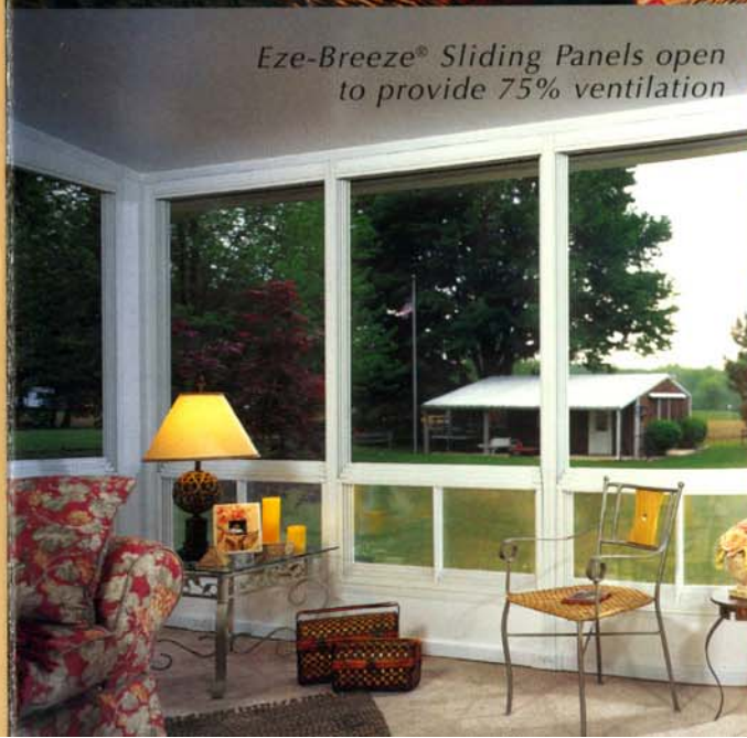
Eze-Breeze® Sliding Panels open to provide 75% ventilation